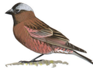
Gray-crowned Rosy-Finch (interior and coastal subspecies)