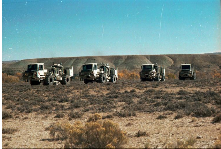
Figure 5. Vibroseis trucks on the West Pinedale 2D Geophysical Exploration Project Area, Green River Basin, Wyoming.

There have been very limited scientific studies of the impacts of vibroseis trucks on desert soils, but one study completed by Menkens and Anderson (1985) in Wyoming reported that soil compaction within the vibroseis truck tire tracks was significantly higher than in untracked areas, and remained so 14 months after the study was completed. An even later visit to the site (two years after the study was completed) revealed that vegetation within the tire tracks had yet to recover. Only one vibroseis truck was used in the Wyoming study - but typically multiple trucks are used in seismic exploration (Evans 1997; BLM, Moab Field Office, 2002).